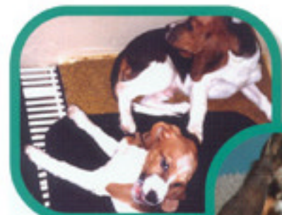
Maladie de Carré